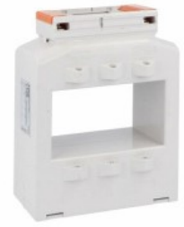
Current transformers DM37T3000 Solid-core