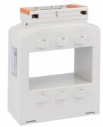
Current transformers DM37T2000 Solid-core