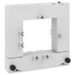
Current transformers DM2TA1000 Split-core