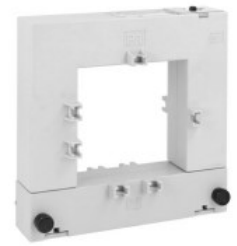
Current transformers DM2TA0300 Split-core