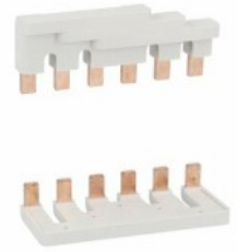
3P Rigid connecting kits for BF95...BF150 BFX3401