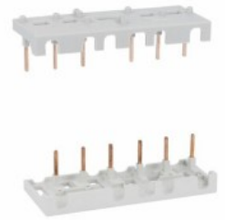
3P Rigid connecting kits for BF26...BF38 BFX3201