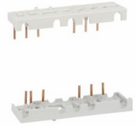
3P Rigid connecting kits for BF09...BF25 BFX3102