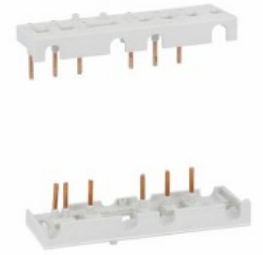
3P Rigid connecting kits for BF09...BF25 BFX3101