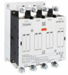
Power contactor BF160