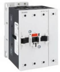
Power contactor BF150