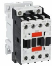
Auxiliary contactor BF00