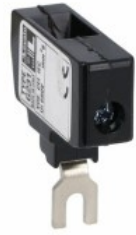
1P enlarged terminals. 1x6mm 2 for BF09...BF25 11G231