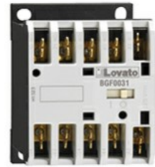
Auxiliary contactor BGF00