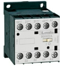
Auxiliary contactor BG00