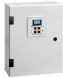
Enclosed automatic transfer switches ATS, with ATL600 controller and four-pole contactors, 125A ATP