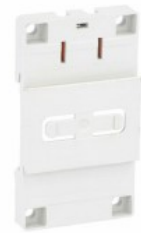
Vertical accessory for battery charger